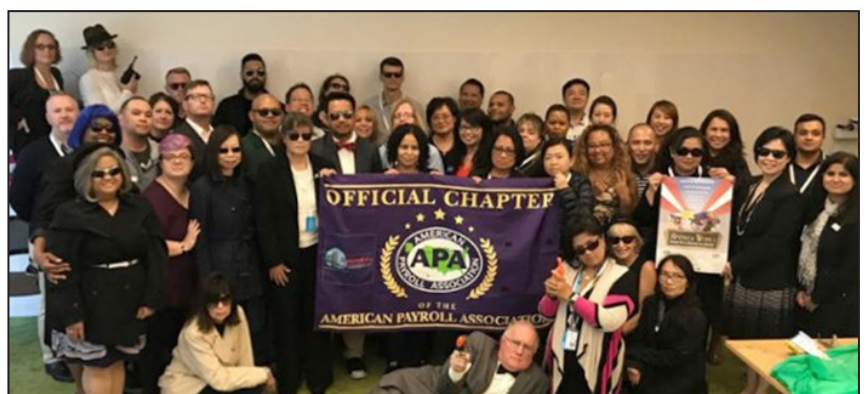
2017 First Place Winner: San Francisco Bay Area Chapter

Please submit photos as JPEG files and photo descriptions in a Word document or PDF. Submit all files to Chapter Relations at chapterrelations@americanpayroll.org .