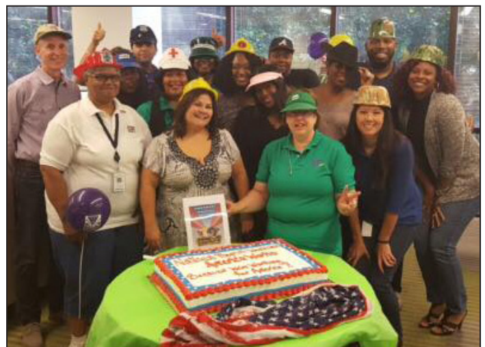
2017 First Place Winner: Atlanta Chapter

Please submit entries in a Word document or PDF file. Submit all files to Chapter Relations at chapterrelations@americanpayroll.org .